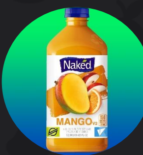
Smoothie Founder & Treasurer