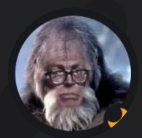
Drelor Dev Team