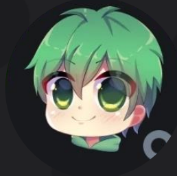
Imalfect Dev Team