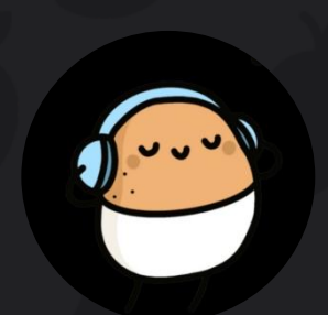
Pocket Mango Police