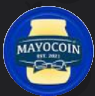
Remarkablemayonaise Mayo Engineer & Top MOD